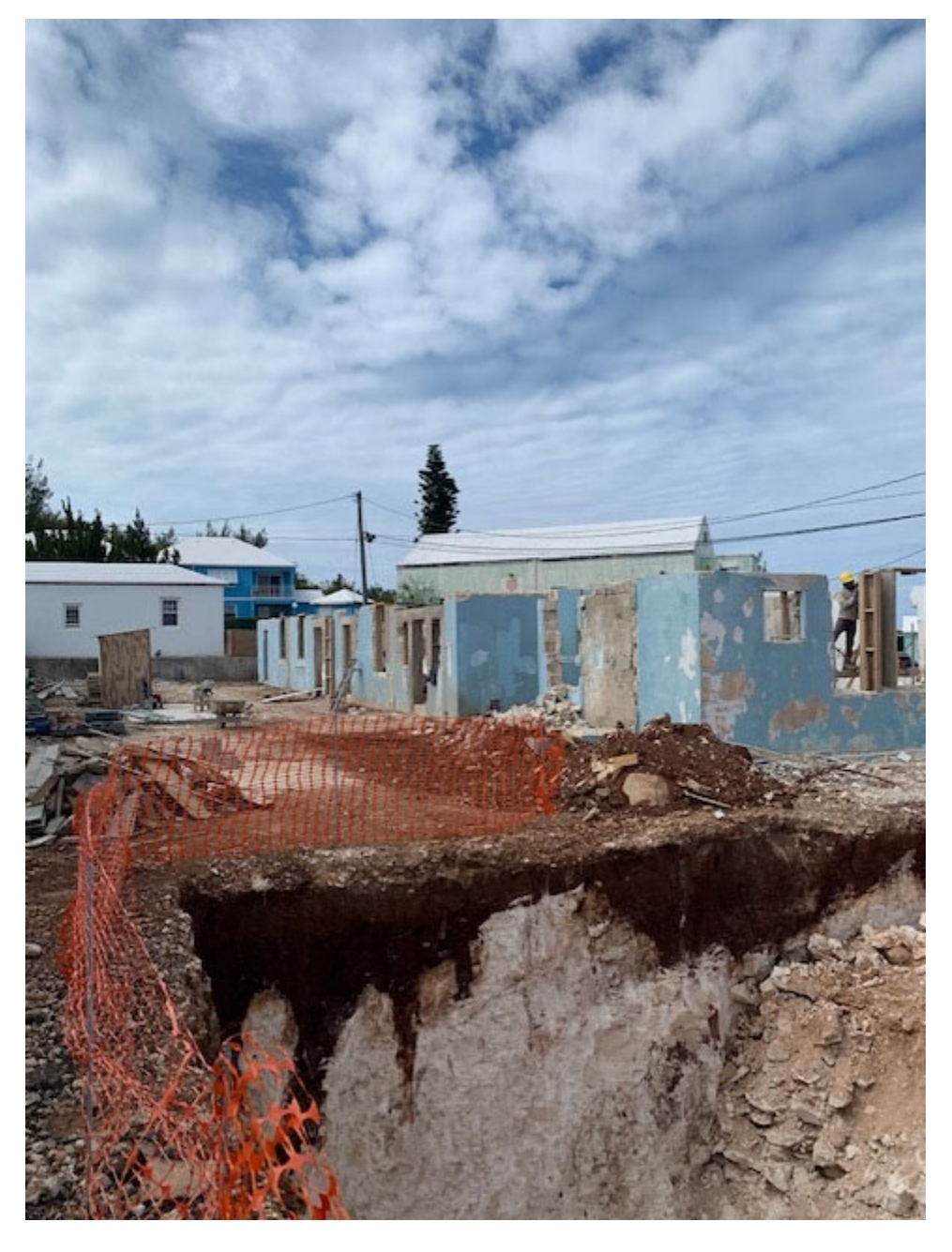
Excavation - Subterrain formation - Typical for this area