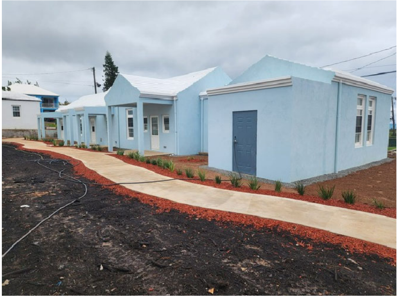
Phase 2 Completed