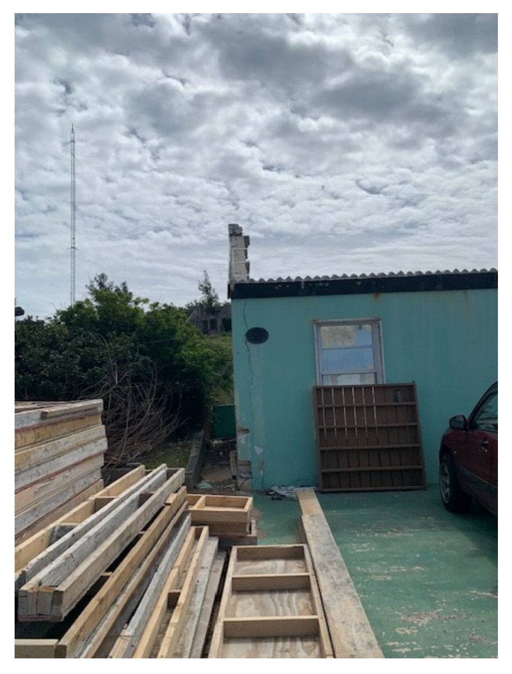
Compromised Gables (Both ends- 18 Battery Road)