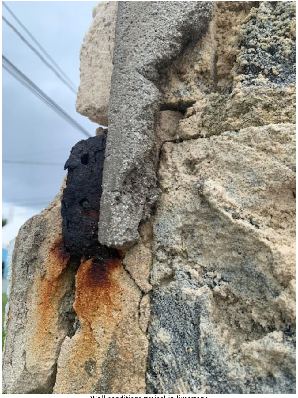
Wall conditions typical in limestone