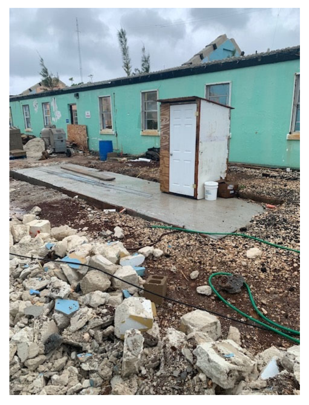
Trees inside of 18 Battery Road Building (Phase II)