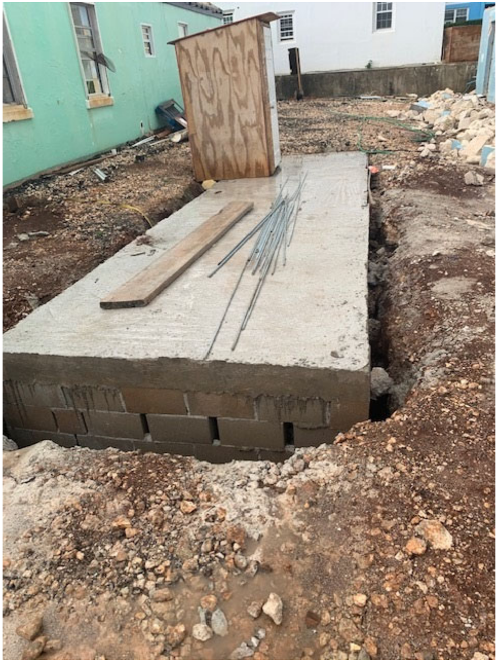
Location of West Cesspit - completed in Phase I