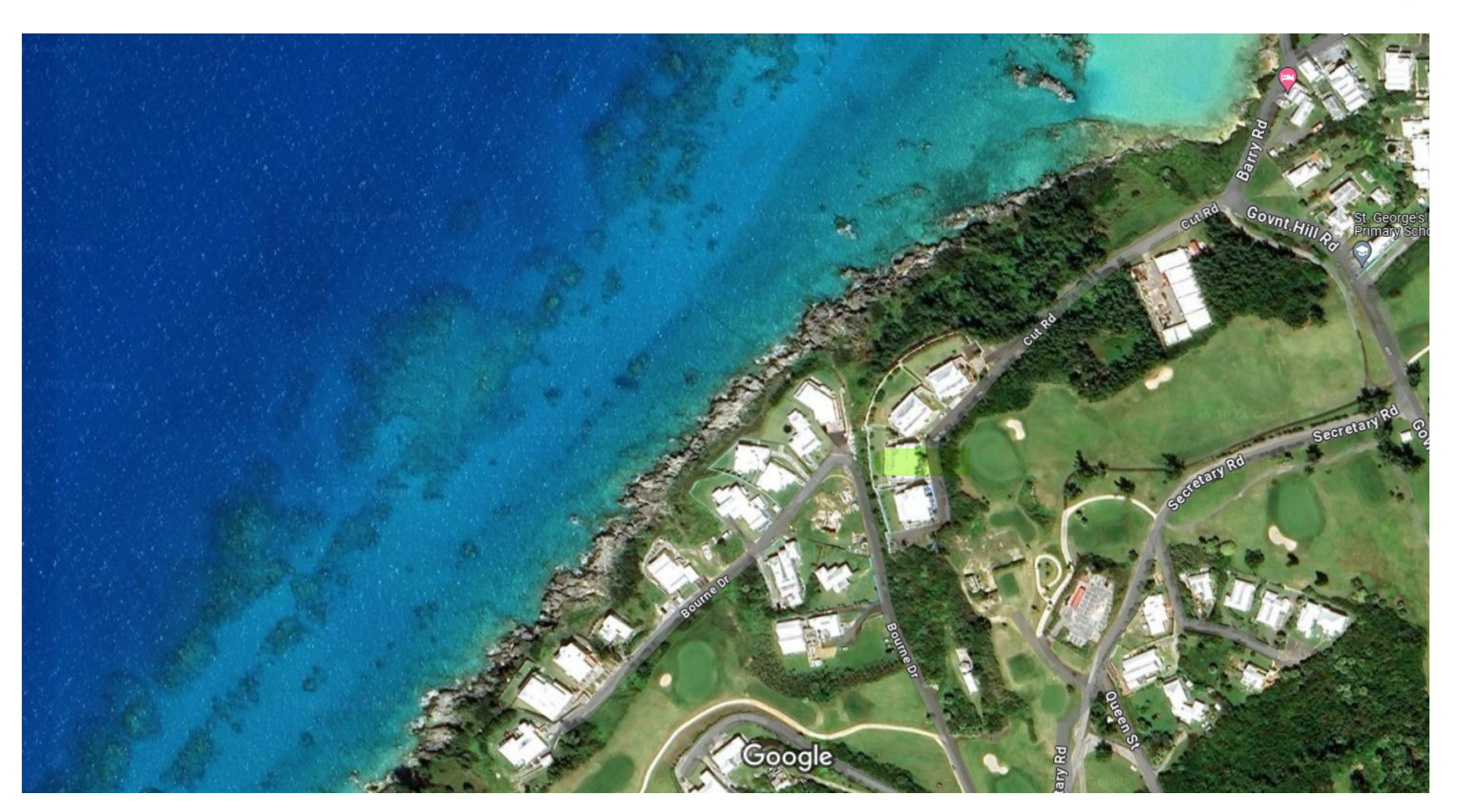
50 m