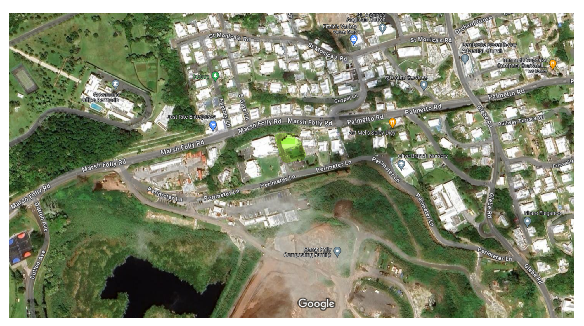
Map data ©2024, Map data ©2024 50 m